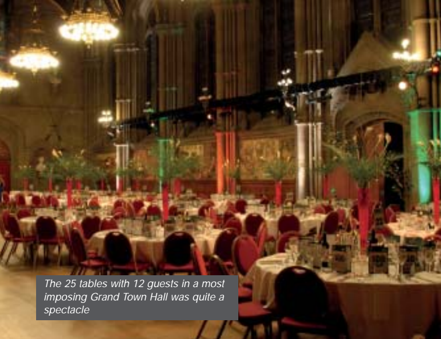
The 25 tables with 12 guests in a most imposing Grand Town Hall was quite a spectacle