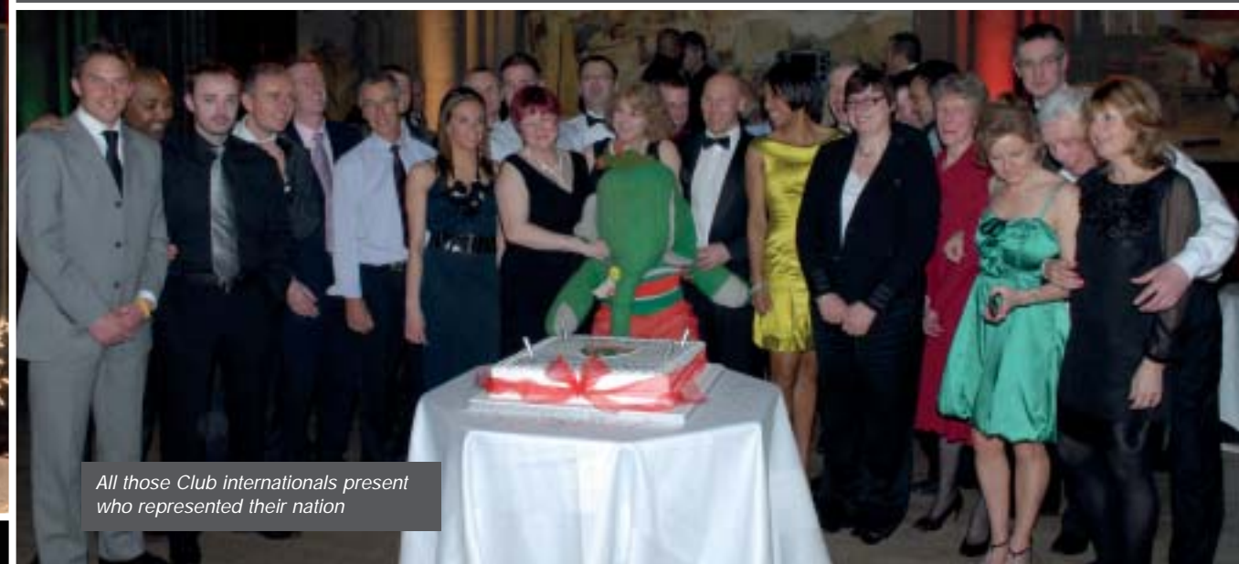
All those Club internationals present who represented their nation