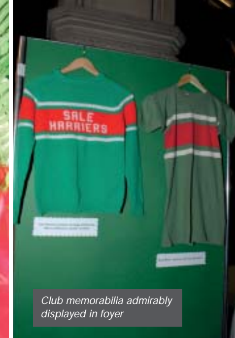
Club memorabilia admirably displayed in foyer