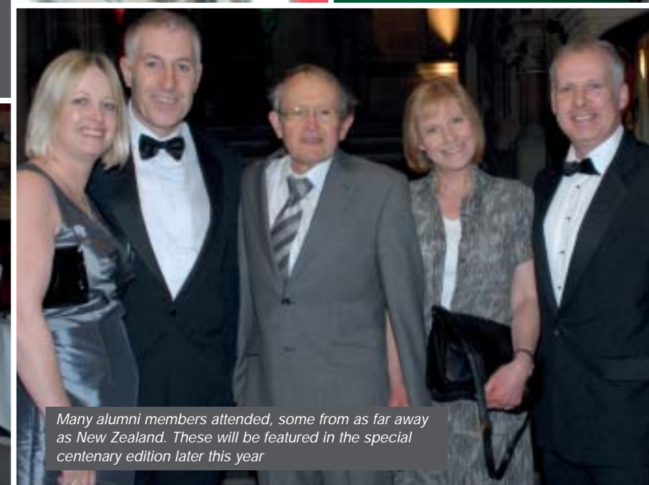
Many alumni members attended, some from as far away as New Zealand. These will be featured in the special centenary edition later this year